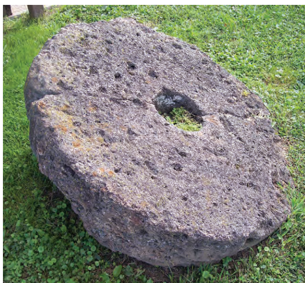
Fig. 12: Raccoon Creek Burr Millstone on display in front of the Vinton Courthouse at McArthur, Ohio. September 13, 2014. Millstone diameter: 1.22 m.