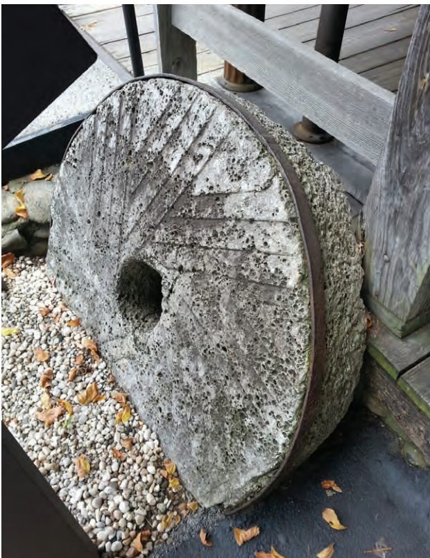
Fig. 13: Possible flint millstone at the Old Mill of Pigeon Forge, Tennessee (No scale).

Presently, there are no documented examples of flint millstones from the Tennessee quarries. Millwright Ben Hassett photographed what he thinks is a flint millstone that may have been manufactured in Tennessee. This millstone is located at the Old Mill of Pigeon Forge at Pigeon Forge, Tennessee (Fig. 13).