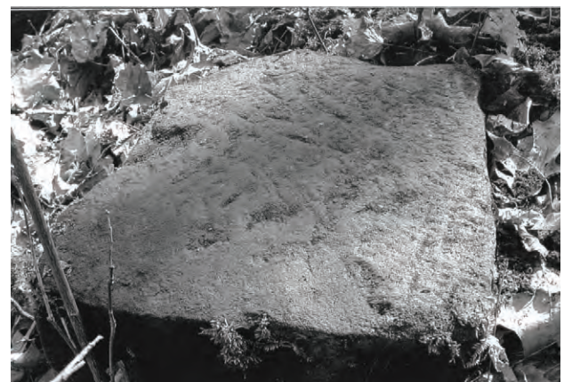
Fig. 11: A stone slab at a Raccoon Creek Burr Millstone Quarry in Near McArthur in Vinton County, Ohio. March 25, 2005. The slab, 12-14 inches across, has numerous tool marks.