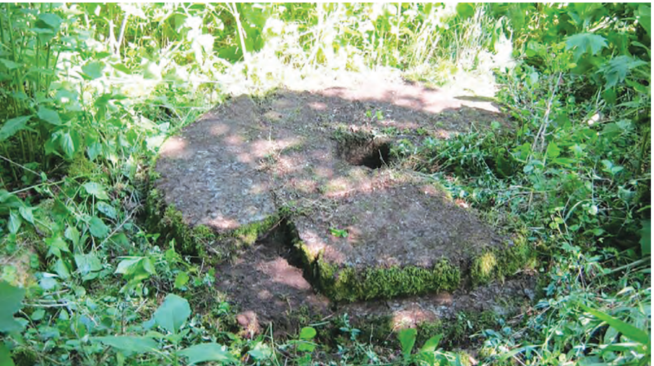
Fig. 6: Unfinished millstone at the Tanner Millstone Quarry in Woodford County measuring 63 inches in diameter. It was discarded during shaping due to irregular breaks.