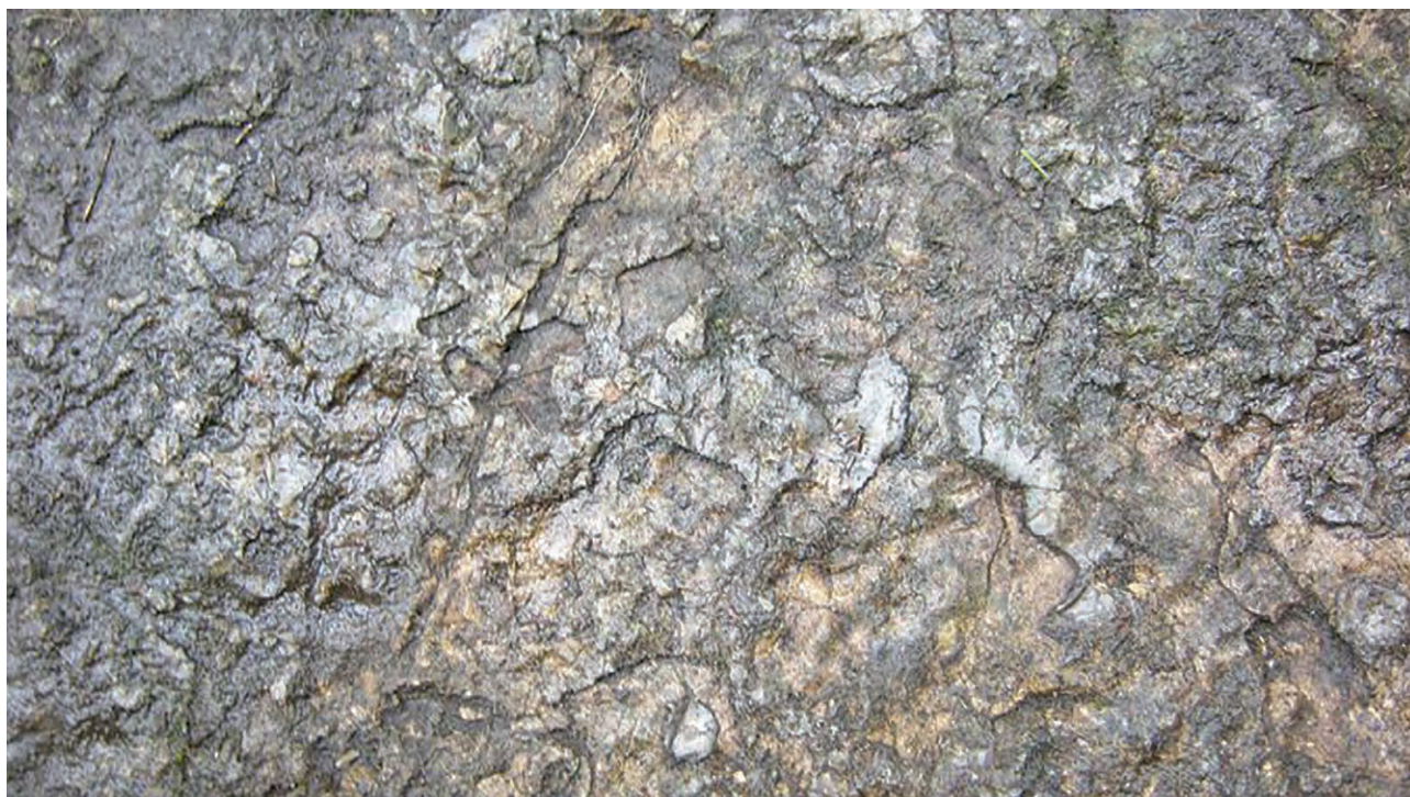
Fig. 4: Close-up view of the Curdsville limestone containing chert nodules at the Tanner Millstone Quarry in Woodford County, Kentucky.

The second millstone (Fig. 7) measured 51 inches (1.295 m) in diameter, was shaped to 5 inches (12.8 cm) below the surface, and had a round eye 6 inches (15.3 cm) in diameter (O'Dell 2016, 21).