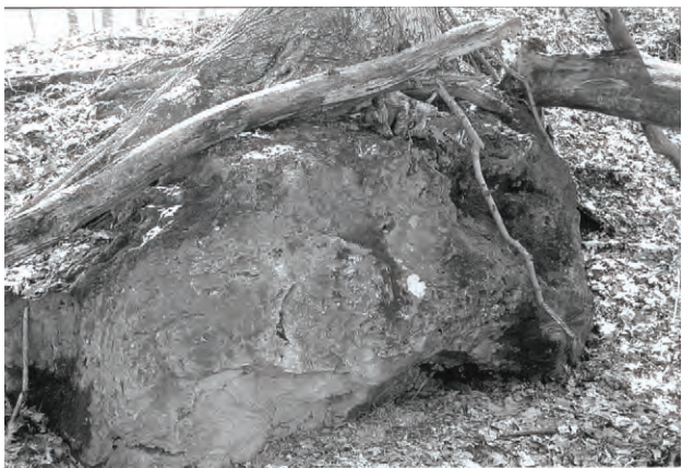
Fig. 10: Large chert boulder with tree growing on top of it in a Raccoon Creek Burr Millstone Quarry pit in Near McArthur in Vinton County, Ohio. March 25, 2005 (No scale).