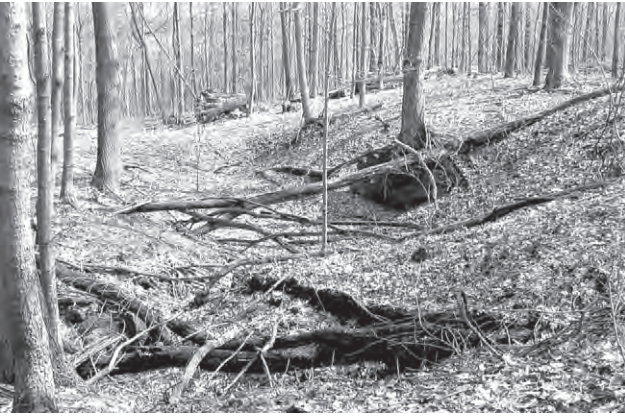
Fig. 8: Pit at a Raccoon Creek Burr Millstone Quarry in Near McArthur in Vinton County, Ohio. March 25, 2005 ( No scale is available).