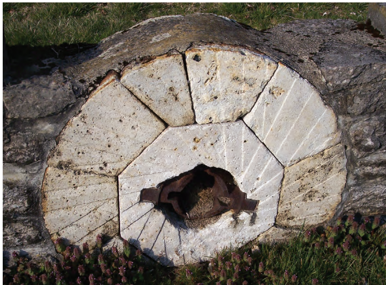
Fig. 2: Composite French Burr Millstone in a wall in front of the Weisenberger home site (mill owners) in Woodford County, Kentucky. November 1, 2013. The millstone is 1.06 m in diameter.

Brie' , which stretches from Vernon, between Paris and Rouen, to Rheims. The principal quarries were those of Bois de la Barre and La Justice du Nord at La Ferté sous Jouarre on the River Marne about 60 km. east of Paris. There were also quarries further east along the river at Épernay.