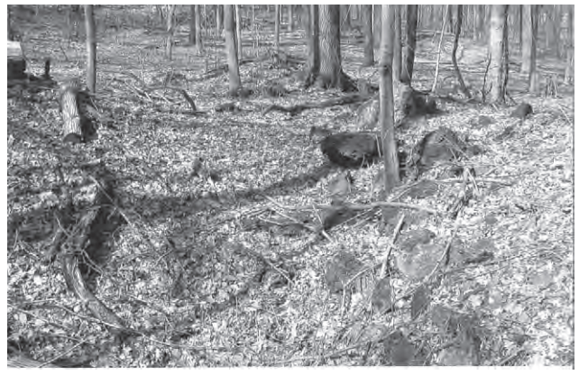
Fig. 9: Working debris at a Raccoon Creek Burr Millstone Quarry in Near McArthur in Vinton County, Ohio. March 25, 2005.