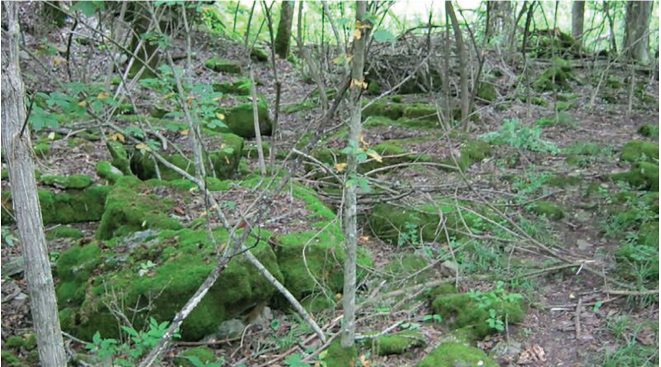
Fig. 5: View of the northern edge of the Tanner Millstone Quarry in Woodford County, Kentucky facing north-northeast.

millstones and other associated quarry remains, and attempting to reconstruct the manufacturing sequence. Ideally, a paper describing this quarry can be published in a volume connected with a future international millstone conference. This will be an important contribution to the literature since we do not currently have any flint millstone quarries documented in the United States.